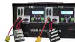
Charger (2 ports)