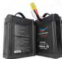
6 pcs.12000 mAh battery